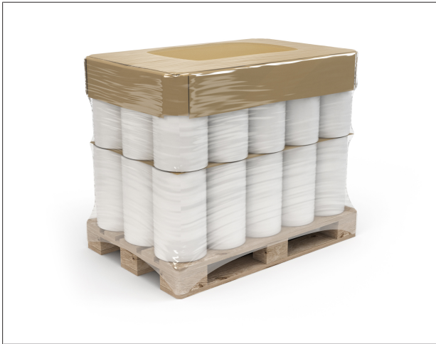
Fig. 1: Pallet with stretch film